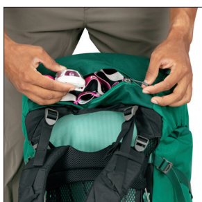
TOPLID WITH POCKET M - 65L / 50L W - 65L / 50L