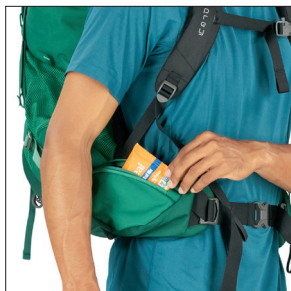
ZIPPERED HIPBELT POCKETS M - 65L / 50L W - 65L / 50L