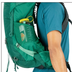
DUAL MESH SIDE POCKETS M - 65L / 50L W - 65L / 50L