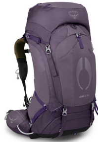
♀ AURA AG 50