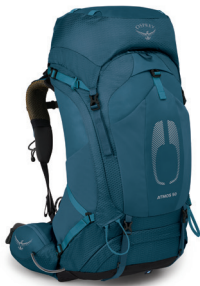
♂ ATMOS AG 50