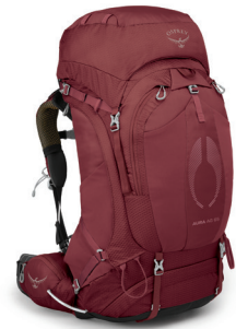
AURA AG 65

Welcome to Osprey. We pride ourselves on creating the most functional, durable and innovative carrying product for your adventures. Please refer to this owner's manual for information on product features, use, maintenance, customer service and warranty.