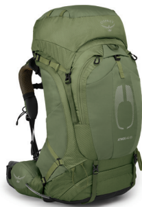
ATMOS AG 65